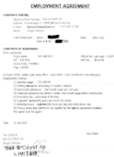
Employment contr Memele 15.06.15.png 224K