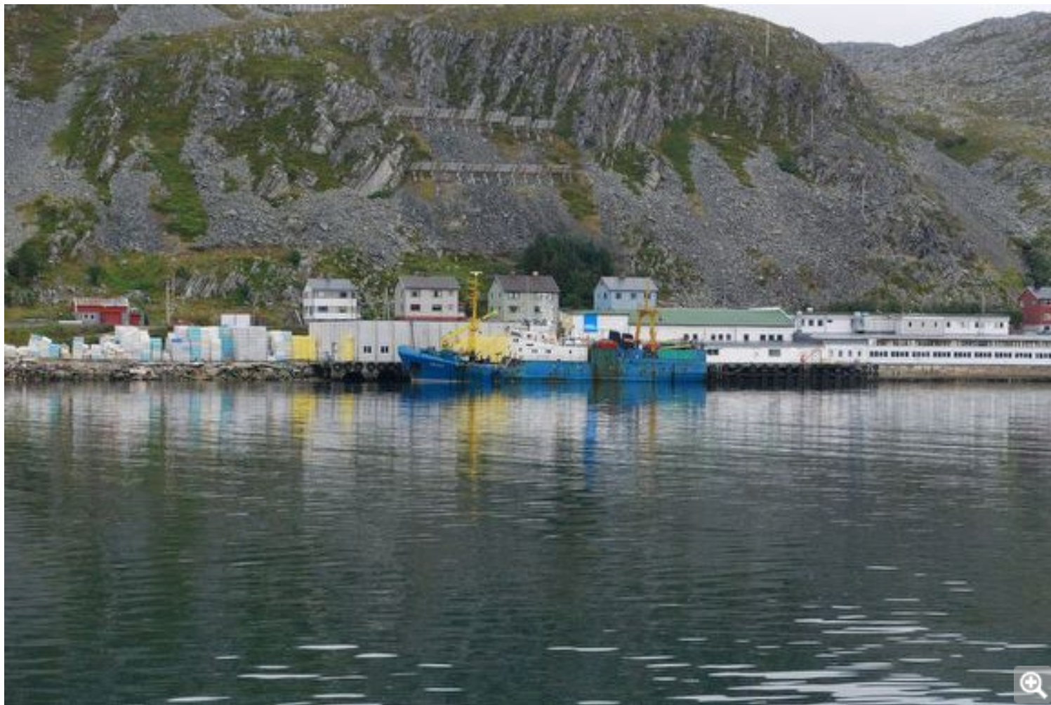
Latvian "Solvita" at Norway Seafood's facility in Kjøllefjord.

The catch has been delivered to Norway Seafood's facility in Kjøllefjord, but Ankipov also says that other factories have shown interest in receiving raw materials from "Solvita".