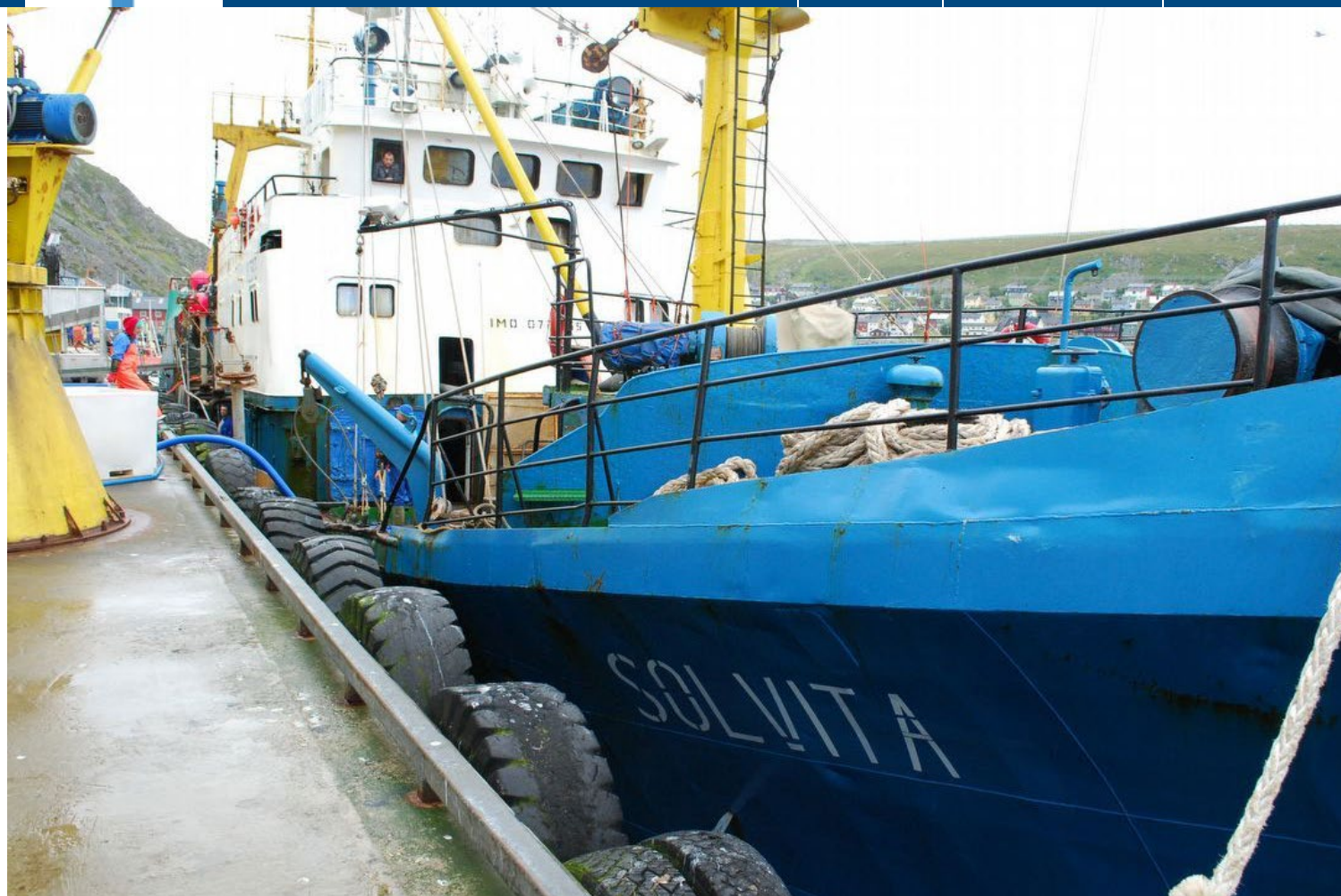
The Latvian trawler "Solvita" delivers 33 tonnes of snow crab in Kjøllefjord.