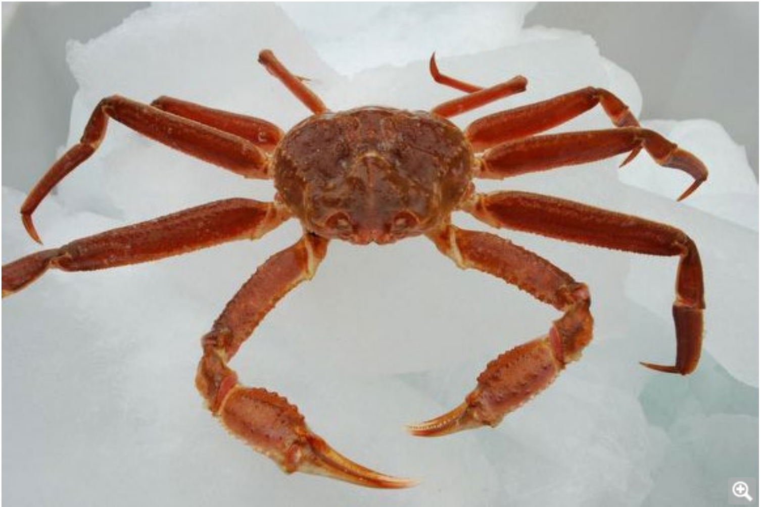
Snow crab

Ankipov is in the process of establishing its own reception for snow crabs in Båtsfjord, Ishavsbruket. The company is expected to be completed in two to three months. Until then, they will deliver to other companies