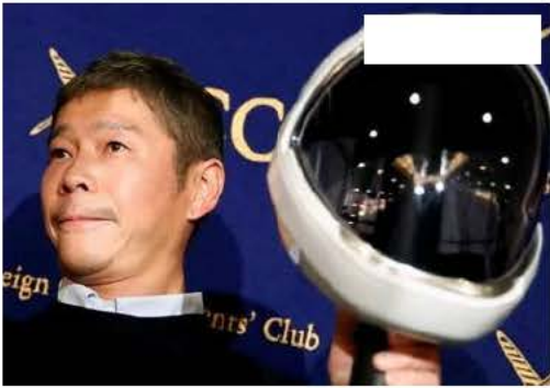
Japanese billionaire Maezawa in $9 million 'social experiment'...