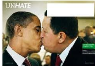
White House slams ad showing Obama-Chavez "kiss"