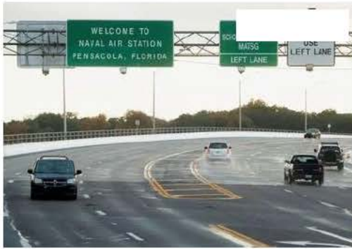
After Florida killings, Saudis withdraw 21 cadets from United States