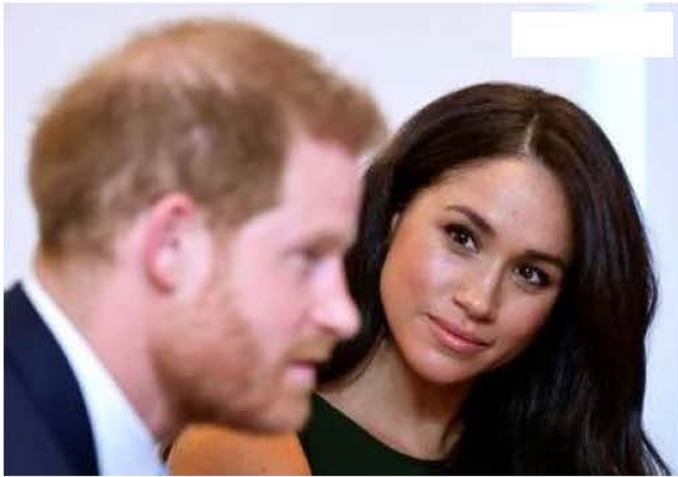
Britain's Prince Harry: 'I will not be bullied into playing a game...