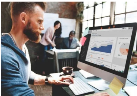
Learn how to buy stocks NerdWallet