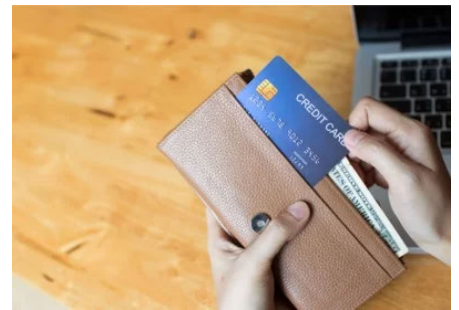
You'll regret not securing this cash back bonus The Ascent