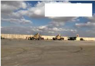
Hours of forewarning saved U.S., Iraqi lives from Iran's missile...