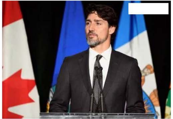
Canada's Trudeau: Iran plane victims would be alive had there been...