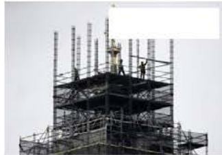
UK's PM proposes crowdfunding to allow Big Ben to bong for Brexit