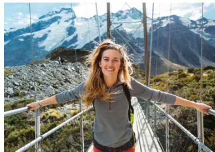
Credit Cards with Massive Rewards for World Travelers NerdWallet