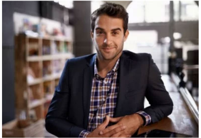
Top 10 Card Offers For People With Excellent Credit CompareCards.com