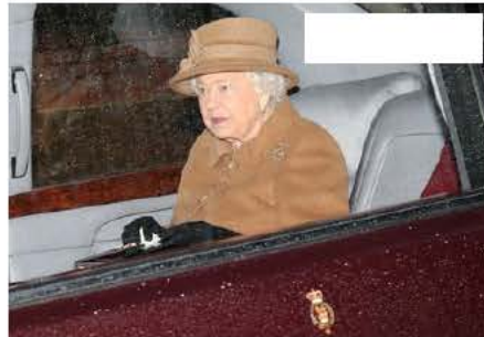
Independence Day: UK's queen agrees grandson Harry, wife Meghan can...