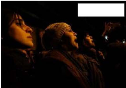
Iran says it has made arrests over plane disaster as protests rage on