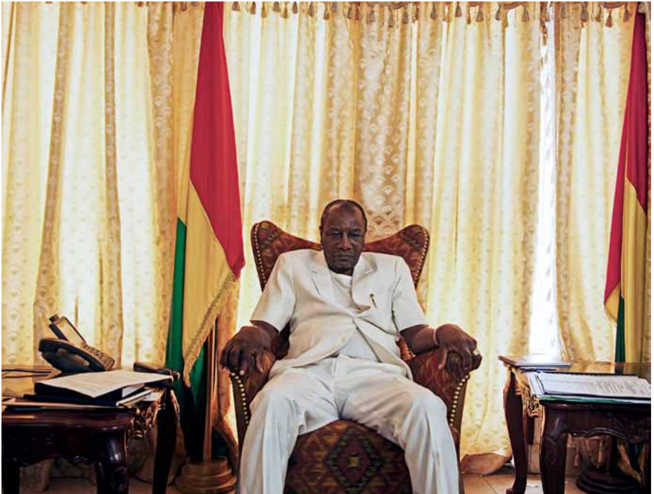
Alpha Condé, Guinea's President, launched an inquiry into whether a parcel of Simandou had been obtained with bribes.