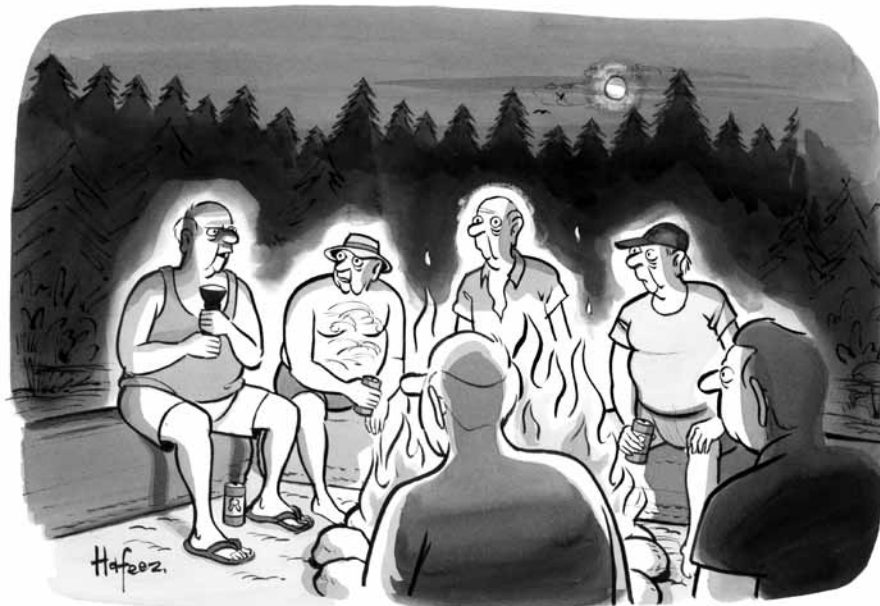
“And that’s how Twitter almost crashed the Dow.”

B eny Steinmetz, who is fifty-six, does not seem to live anywhere in particular. He shuttles, on his private jet, between Tel Aviv (where his family lives, in one of the most expensive houses in Israel), Geneva (where he technically resides, for tax purposes), London (where the main management office of B.S.G.R. is situated), and far-flung