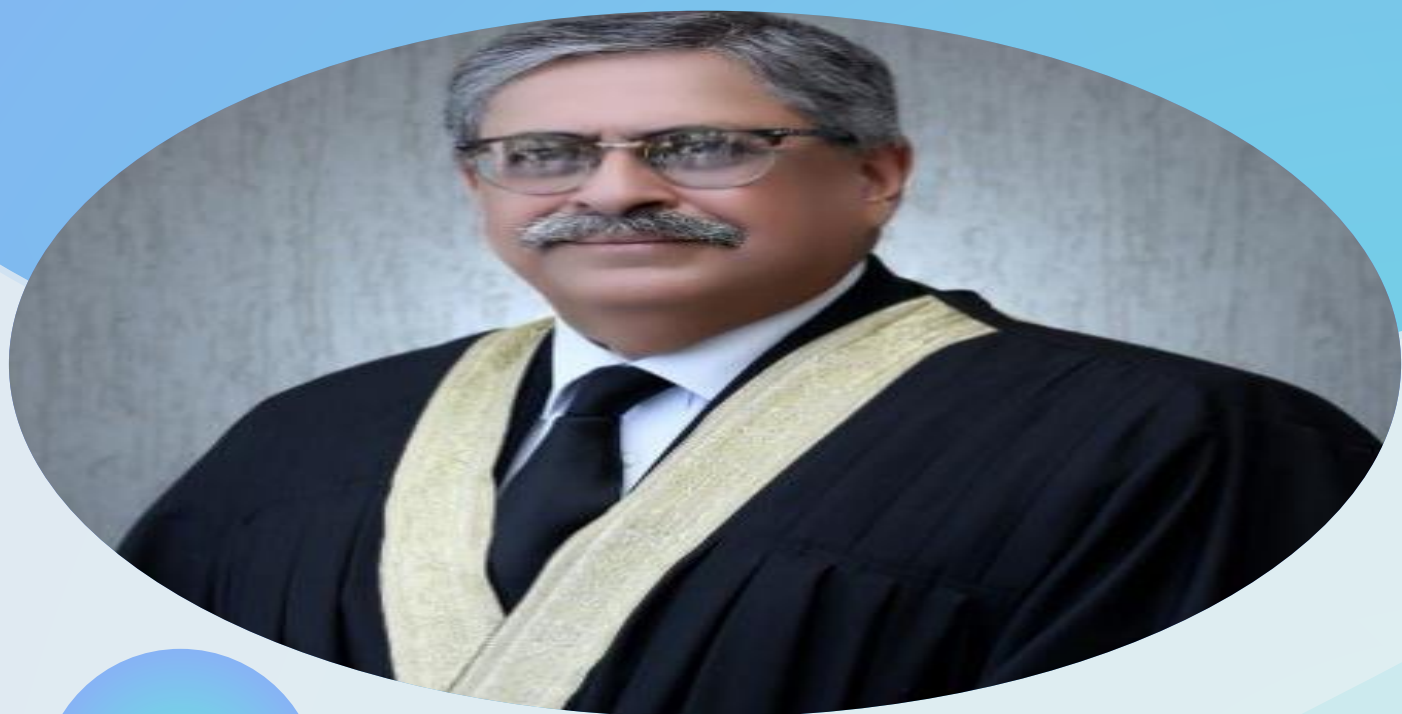
Honorable Chief Justice Athar Minallah, Islamabad High Court